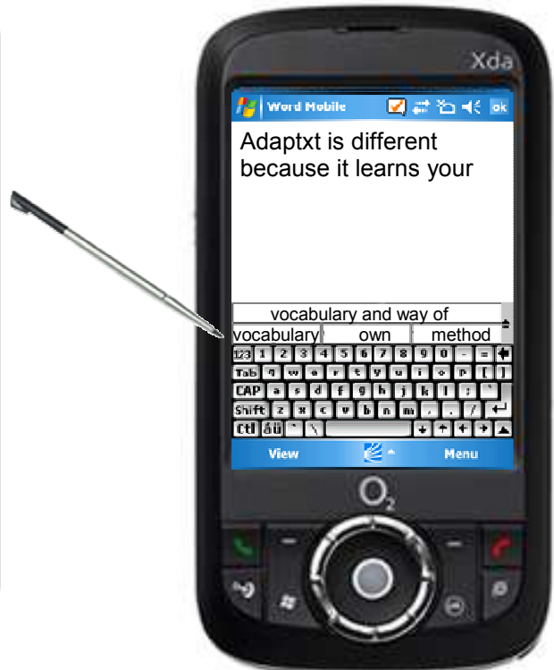
Select correct word with one touch

If you have a query please click on 'submit enquiry' and 'open a new ticket'. Our technical support team can now track your enquiry and will respond promptly.